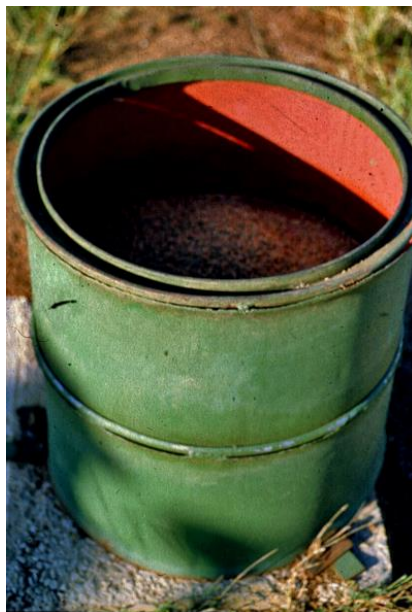
Image 14: Container with lick – rim filled with pour on tick dip that make contact with animal