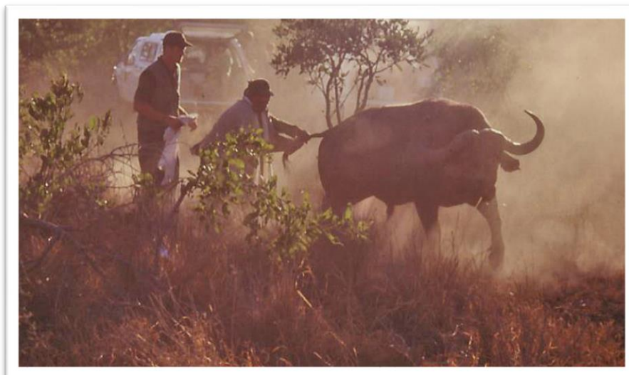
Image 10: Immobilized buffalo bull pulled down by the capture team